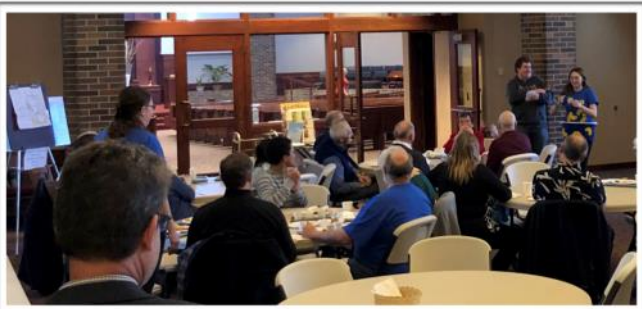
Photos from Taste of Federated (March 31, 2019)