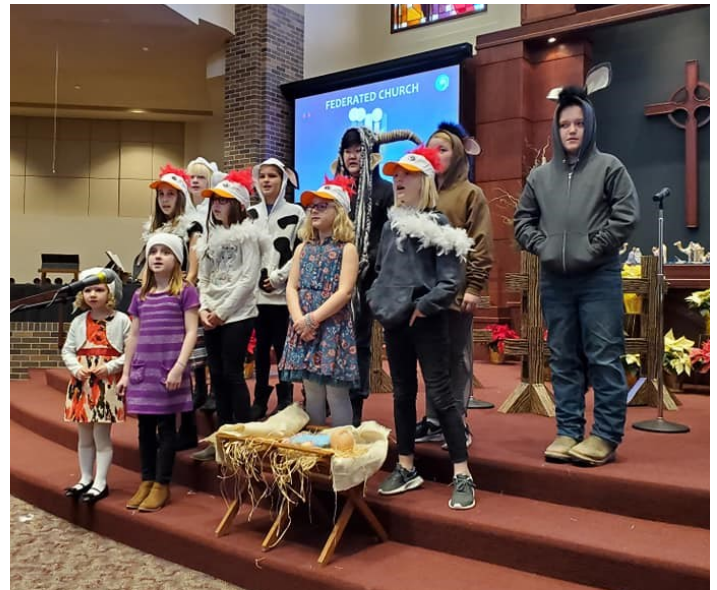
2019 Children's Christmas Pageant and All-Church Caroling