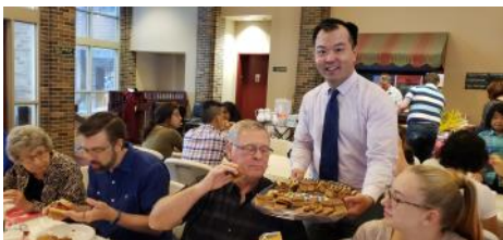
Photos Below and Right: September 30 - BBQ hosted by Youth Ministry Comm.