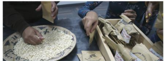
PRESBYTERIAN HUNGER PROGRAM Share your Bread with the Hungry

with the kind of love that is shared freely with all people. Your gifts to One Great Hour of Sharing bring a beacon of love and hope in our world and put the power of healing into the hands of those who need it most through three life-saving programs ~