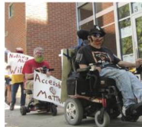
SELF-DEVELOPMENT OF PEOPLE Loose the Bonds of Injustice