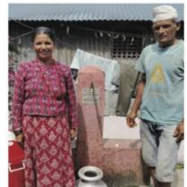
PRESBYTERIAN DISASTER ASSISTANCE Restore Streets to Live In