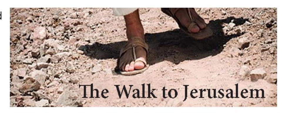
Did you know walking is mentioned over 200 times in the bible?

- Give a mile credit for every 20 minutes of physical activity a person performs. This can include performing therapy motions, or maybe armchair aerobics for those who have knee or hip problems or are wheelchair-bound.