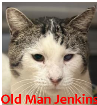
Old Man Jenkins