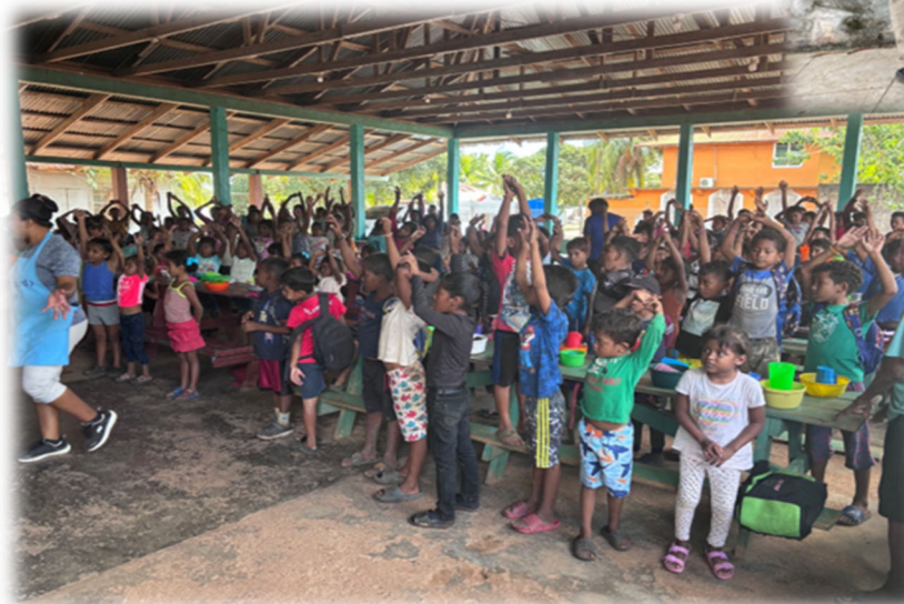
Children at the Feeding Station