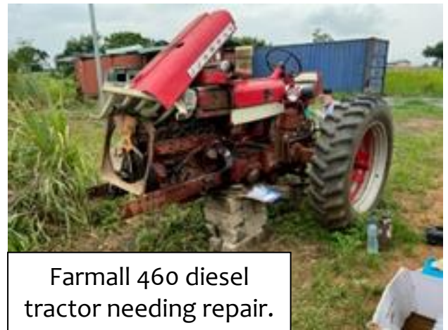
Farmall 460 diesel tractor needing repair.