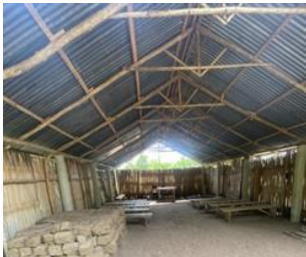
A local school near the medical clinic campus.