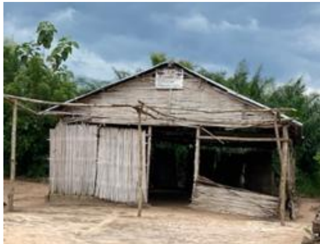
A local church near the medical clinic campus.