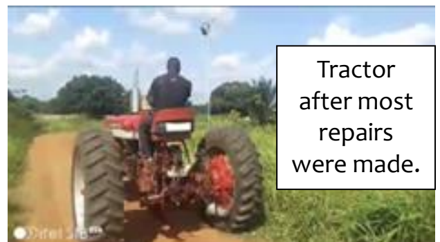
Tractor after most repairs were made.