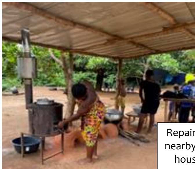
Repaired Salama stove in nearby village, and typical housing in rural Togo.