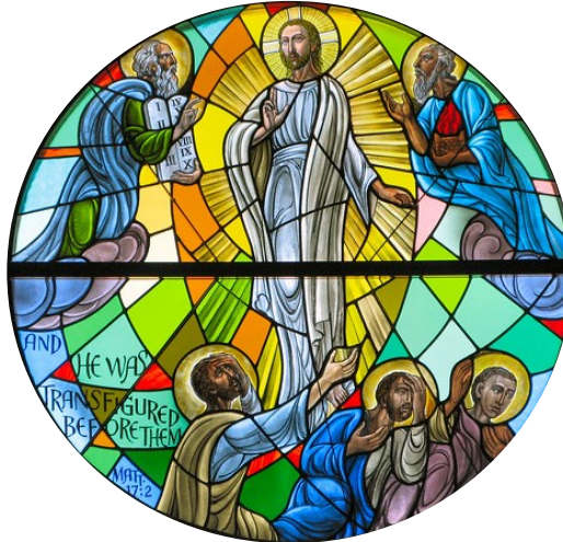
Transfiguration of the Lord